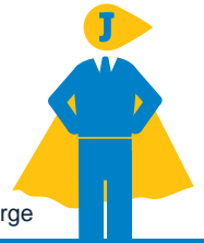
J the concierge

At Japan Identification Co., Ltd. (JID), we want to provide a concierge service you can trust and feel secure about.